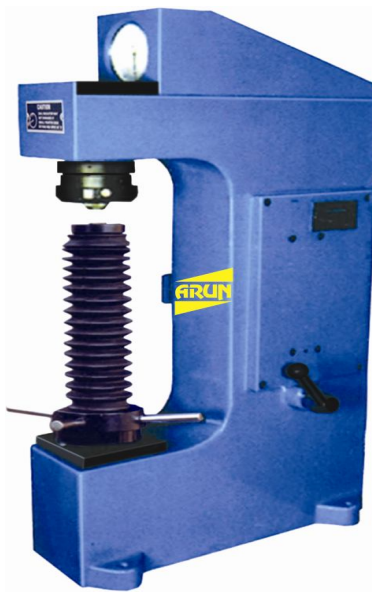
RAB - 250