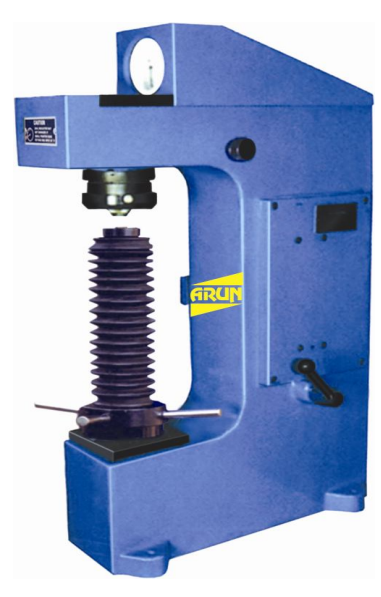
RAB - TWIN